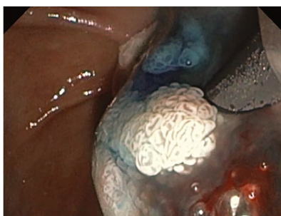
i-scan can be used to highlight adenomas pit pattern structures