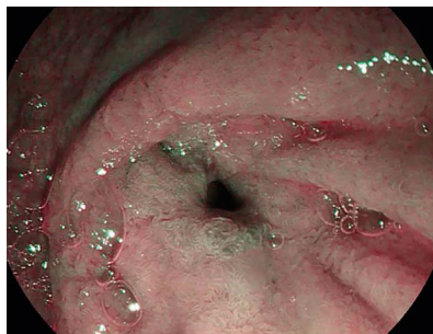
i-scan OE increases contrast and visualizes vascular patterns