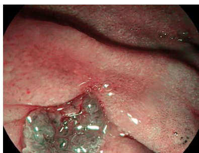
i-scan OE can help to precisely visualize the area to be ablated