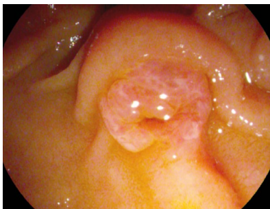
i-scan facilitates the visualization of the orifice of the papilla

HD+ imaging allows better visualization and anatomical interpretation of papillary structures for an easier cannulation of the ducts. i-scan can be used to highlight and assess lesions.