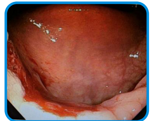
Fig. 2: Clean resection site with the CoinTip snare